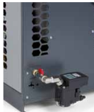
with mounted KONDRAIN® N5