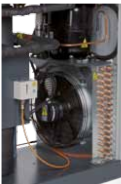
Easy access to the clear structured interior