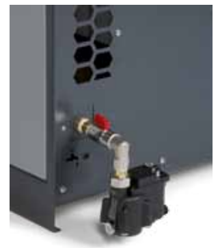
with mounted KONDRAIN® N1