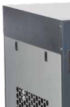
Clever clip-locks and easily removable side panels