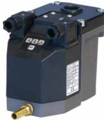
Type N-HP level-regulated – high pressure

Level-regulated and time-controlled condensate drain · high pressure